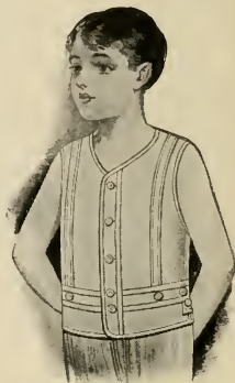
Style No. OOF

Sizes 2 to 12 Price best grade, - 50c. Medium grade, - 25c.