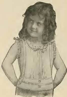
Style No. 43

Sizes 1 to 14 years old Price best grade, 50c. Medium grade, 25c.